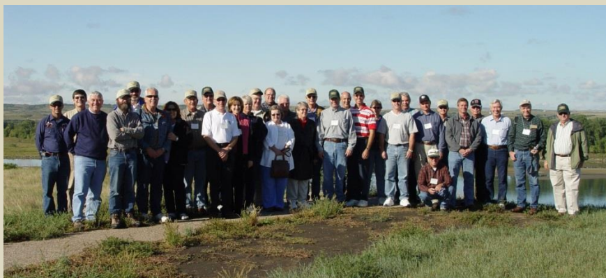
Group Photo at Missouri River Double Ditch Indian Village, North Dakota